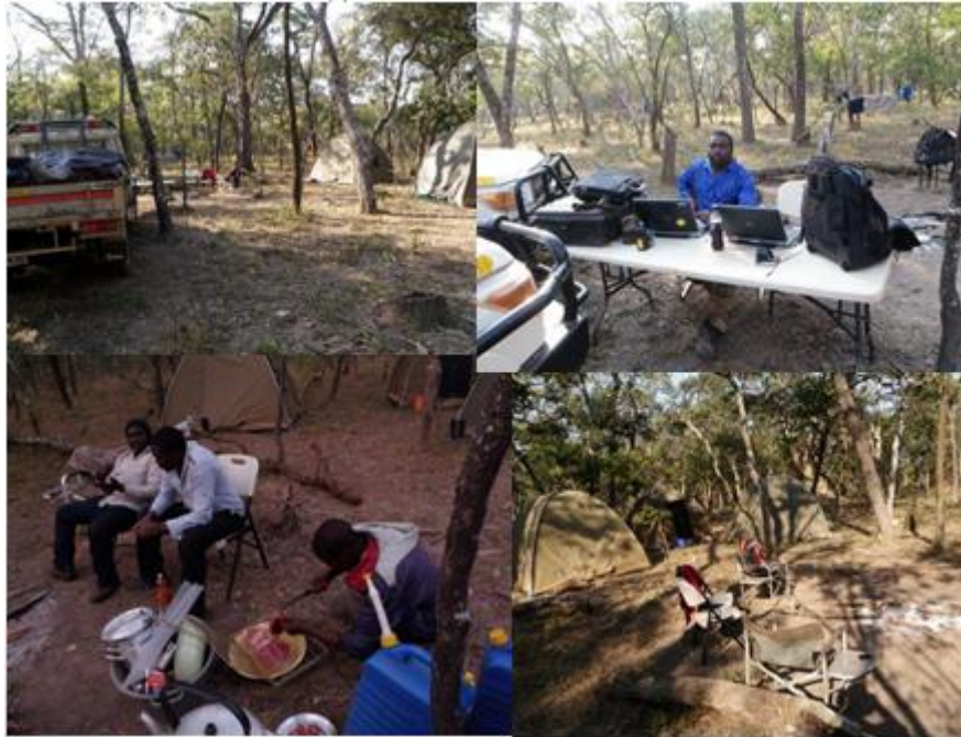
Fly camping in Central Africa.

others. As it is, undiscovered deposits of the future are located in often inhospitable environments. Therefore, geologists thinking about working in exploration, should consider this factor as well.