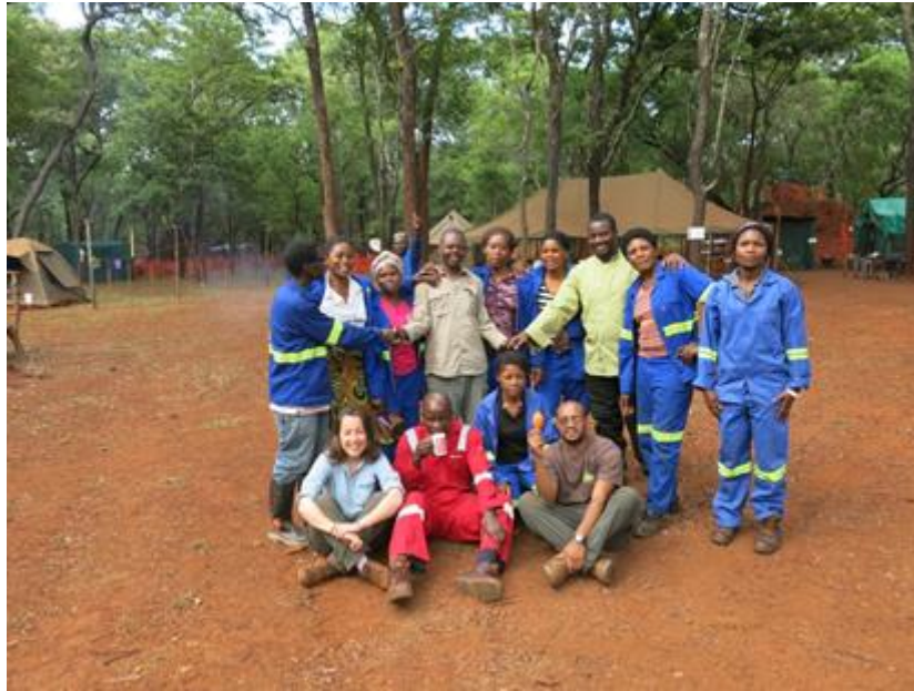
A great team and leader are key for success in the field.

Wherever you go as an exploration geologist, you will be working with people of different cultural backgrounds. This is especially true when operating in developing countries. How you were brought up in the past, is not necessarily how your colleagues were brought up. Inevitably, situations like this after a few months in the bush might well lead to irritations. Working as part of a team requires the geoscientist to recognise and adapt to a new and different environment. Learn languages as well. For example, in Zambia and the Kaonde lands, a “Bena kukeba kuchja chike” (I would like to eat chicken) goes a lot further than asking for it in English.