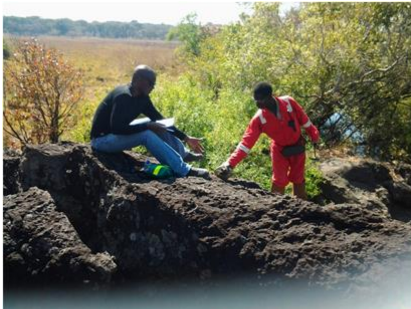
The ability and interest to read rocks is key.

I believe that basic 101 geology and mineralogy skills are still the foundation of modern geoscience. True, many of us nowadays use specialised software to deal with geological problems. Nevertheless, it is of utmost importance to understand the rocks and geological environment (and mineral system from source to deposit) you are dealing with. In 2015, I read a heated discussion in the Geoscientist magazine (Geological Society of London) where one geologist was strongly criticised for his opinion of introducing more applied subjects to the usual traditional curriculum and focus less on traditional mapping techniques. Whilst I agree with the prevailing opinion, it is nevertheless true that geoscience graduates nowadays enter the mining industry with only a few, academic, modules and lack an in-depth knowledge of for example, applied exploration geochemistry, drilling methods and software modelling skills. This needs to be considered in the design of future programmes.